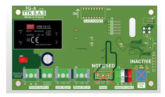
FG-A-OD Connector Description