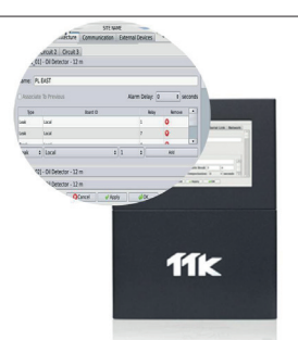
Easy setup of relays for each cable